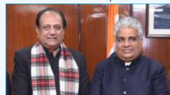
Sh. Bhupender Yadav Union Cabinet Minister for Environment, Forest & Climate Change, and Labour & Employment