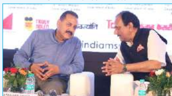
Dr. Jitender Singh Union Minister (MOS) Prime Ministers Office (PMO)