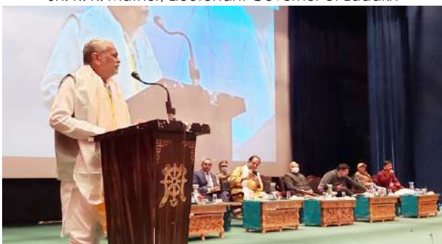
Sh. Parshottam Rupala, Minister of Fisheries, Animal Husbandry and Dairying