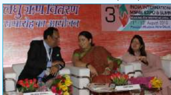
Smt. Smriti Irani, Minister of Women & Child Development addressing the Expo-Summit