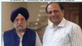
Sh. Hardeep Singh Puri Minister of Petroleum & Natural Gas, Housing & Urban Affairs