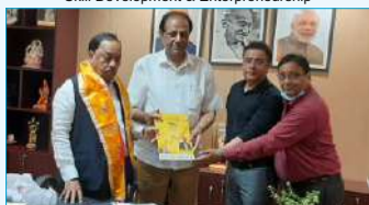
Sh. Narayan Rane, Union Minister of MSME