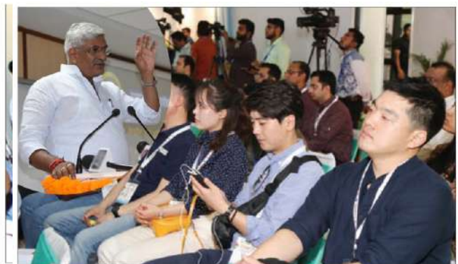
Sh. Gajendra Singh Shekhawat, Union Cabinet Minister of Jal Shakti (Water Resources) With Foreign Delegates, delivering Keynote address on opportunities in Water Resources Management in India