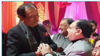
Sh. JP Naddha, President of Bhartiya Janta Party