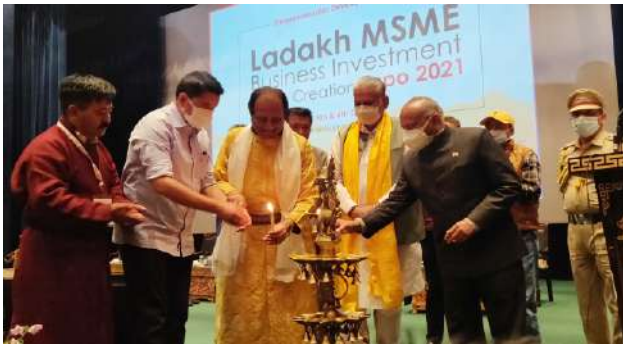
Sh. Parshottam Rupala, Minister of Fisheries, Animal Husbandry and Dairying Sh. R. K. Mathur, Lieutenant Governor of Ladakh