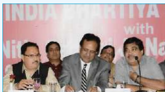
Sh. Nitin Gadkari, Union Minister of Road Transport & Highways