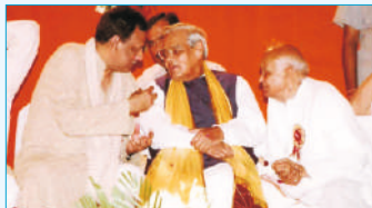
Sh. Atal Bihari Vajpayee Former Prime Minister of India