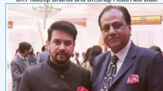
Sh. Anurag Thakur, Union Minister of I&B, Youth Affairs & Sports