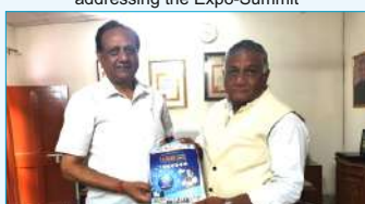
General Vijay Kumar Singh, Union Minister (MSO), Ministry of Road Transport and Highways