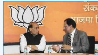
Sh. Rajnath Singh, Union Defence Minister