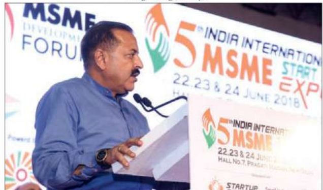
Dr. Jitender Singh, Union Minister (MSO) Prime Minister Office (PMO) & DONAR