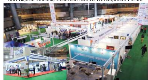
Aerial View of MSME Expo - 2014