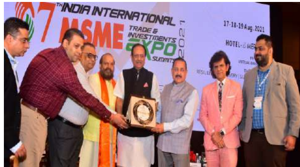
Dr. Jitender Singh Union Minister (MOS) Prime Ministers Office (PMO)