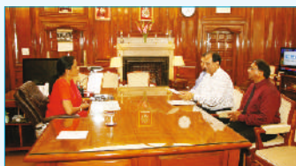
Smt. Nirmala Sitharaman, Union Finance Minister