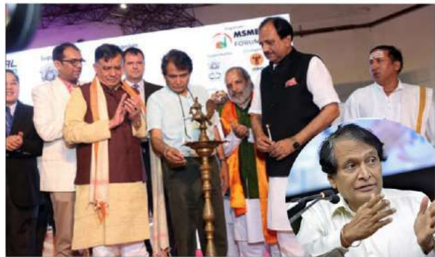
Sh. Suresh Prabhu, Union Minister of Railways, Commerce & Industry with Sh. Satish Mahana, Industry Minister, U.P & Sh. Jai Bhagwan Goel Inaugurating 5th Expo