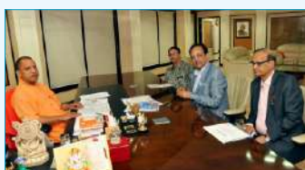
Sh. Yogi Adityanath, Chief minister of Uttar Pradesh