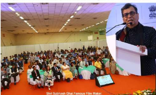
Shri Subhash Ghai, Famous Film Maker