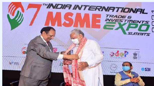
Shri Parshottam Rupala, Minister of Fisheries, Animal Husbandry and Dairying