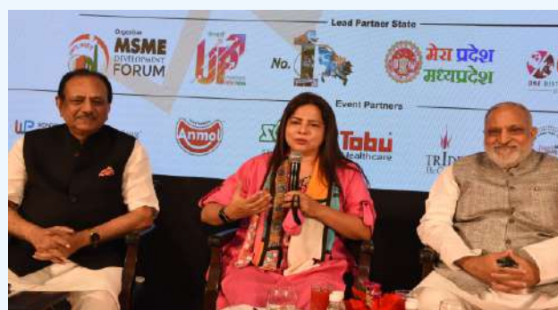
Smt. Meenakshi Lekhi, Minister of State for External Affairs and Culture