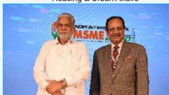
Sh. Parshottam Rupala Union Cabinet Minister of Agriculture, Dairy and Fisheries