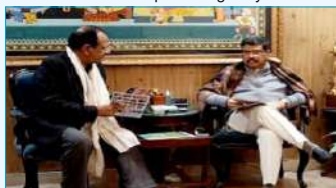
Sh. Dharmendra Pradhan, Union Minister of Education, Skill Development & Entrepreneurship