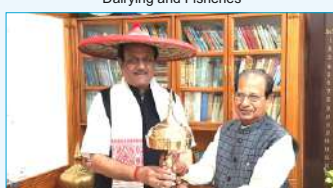
Sh. Jagdish Mukhi, Governor of Assam