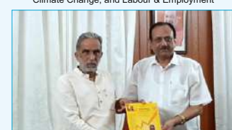
Shri Krishan Pal Gurjar, MOS-Heavy Industries & Public Enterprises & Power