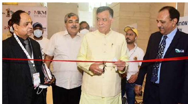
Sh. Satish Mahana, Industry Minister, U.P.