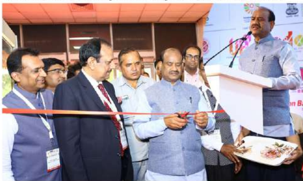
Sh. Om Birla, Speaker of Indian Parliament