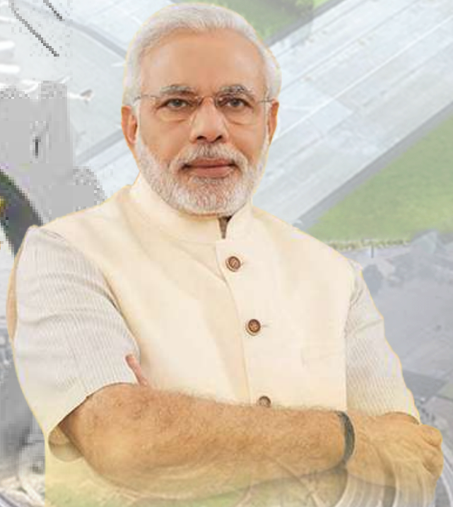
Shri Narendra Modi Hon'ble Prime Minister of India

B2G/B2B MEETS - NETWORKING NEW OPPORTUNITIES