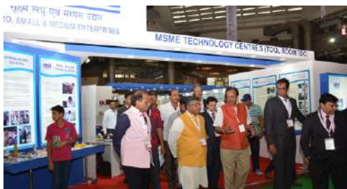
Shri Ravi Shankar Prasad, Union Electronic & IT Minister