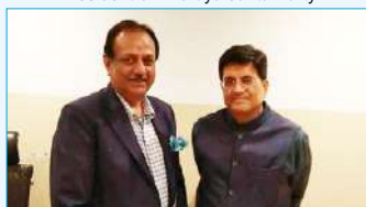
Sh. Piyush Goel, Union Minister of Commerce, Industry, Textiles & Consumer Affairs