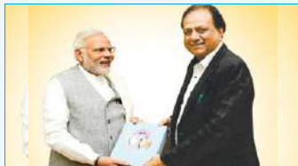
Sh. Narendra Modi Prime Minister of India