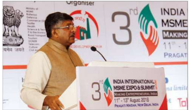
Sh. Ravi Shankar Prasad, Union Cabinet Minister for I.T, ITEs, Electronics & Law, deliberating on Ease of doing business policies & new opportunities in India